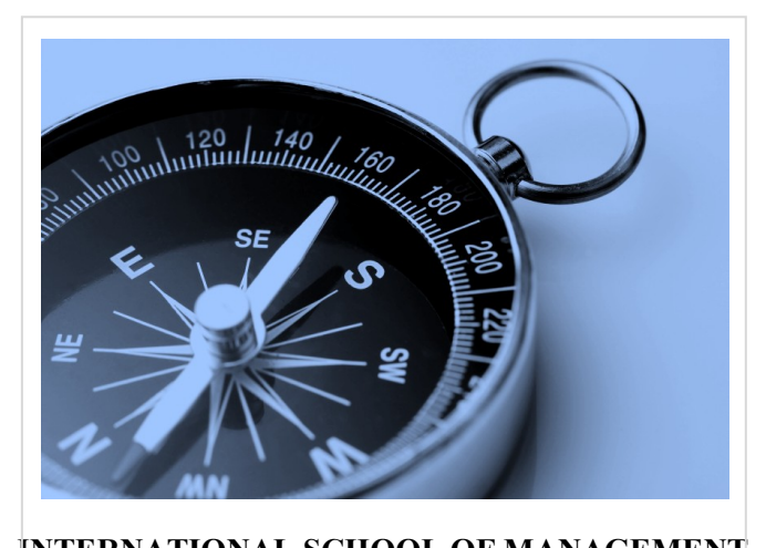
PARIS | NEW YORK | NEW DELHI | SHANGHAI